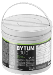
BYTUM LIQUID page 50