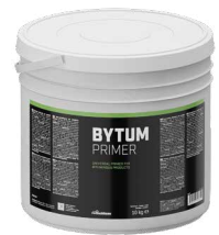
BYTUM PRIMER page 53